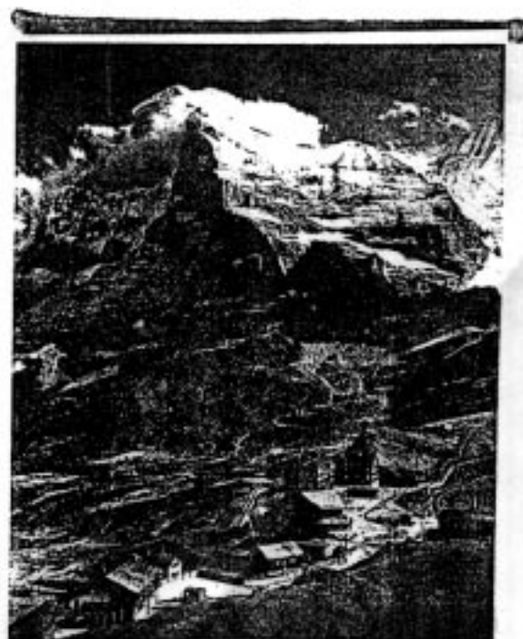
Artist's sketch of Garabaldi Glacier with Jen Jurlando's house in foreground

Even the crack team that revealed the long-held secret was not immune to a certain amount of perspective. As